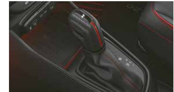
7 speed DCT (Dual clutch transmission)