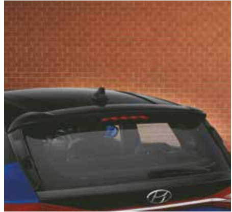
Sporty tailgate spoiler with side wings

Other features: Athletic red highlights (front skid plate & side sill garnish) | Front fog lamp chrome garnish