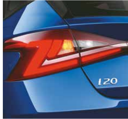
Z-shaped LED tail lamps