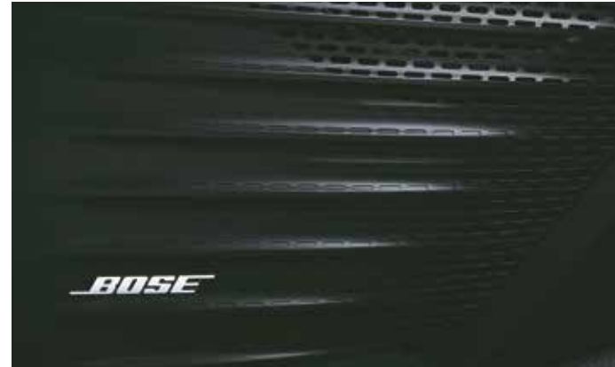
Bose premium 7 speaker system