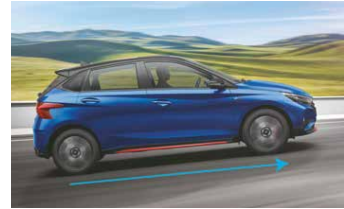
Hill-start assist control (HAC)