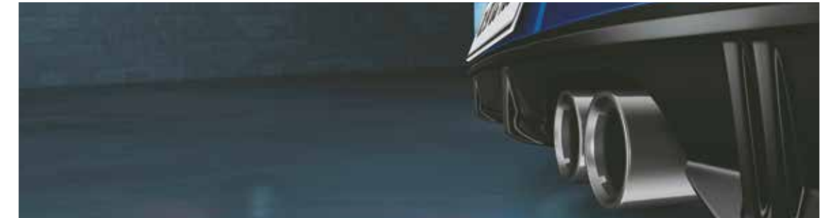
Sporty twin tip muffler

88.3 Maximum power kW (120 PS) @ 6 000 r/min