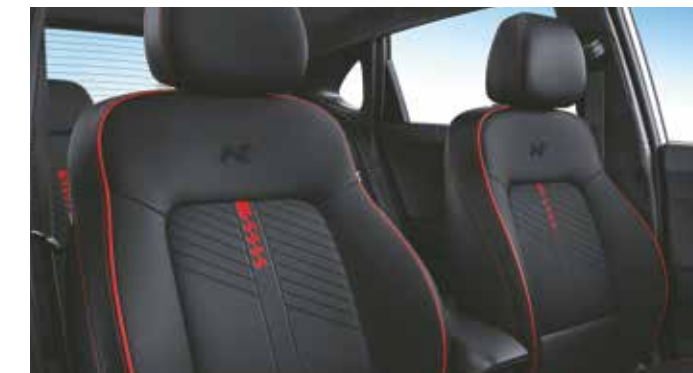
Chequered flag design leather seats with N logo