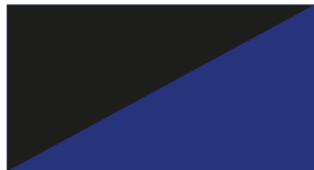
Thunder blue with abyss black roof