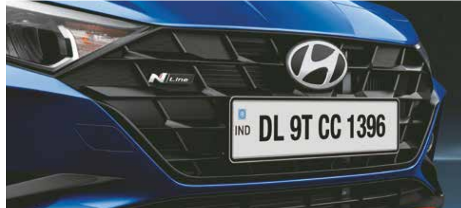
Sporty black radiator grille

Athletically aesthetic, the new Hyundai i20 N Line is built to command attention, all the way from the subtle chrome garnish on the foglamps to the tailgate spoiler with side wings. The sporty red highlights accentuate the performance inspired design, ensuring that all eyes are always on you.