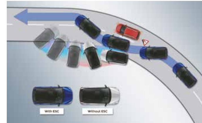
Electronic stability control (ESC) & Vehicle stability management (VSM)