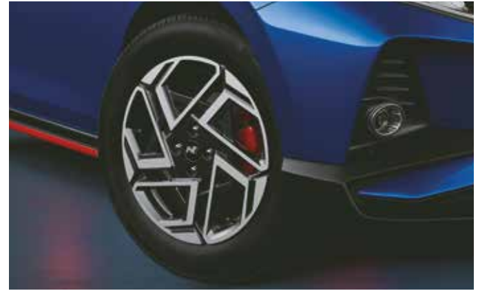
Front and rear disc brakes