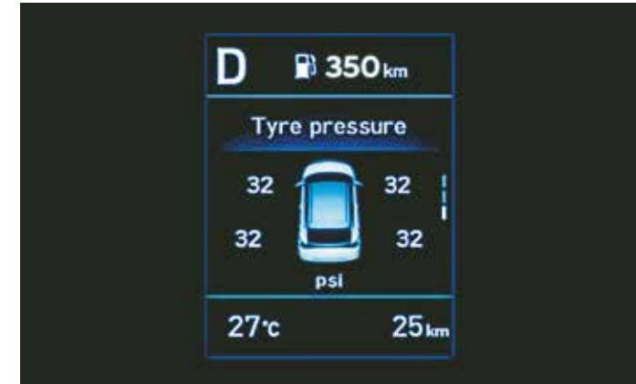
Tyre pressure monitoring system (highline)