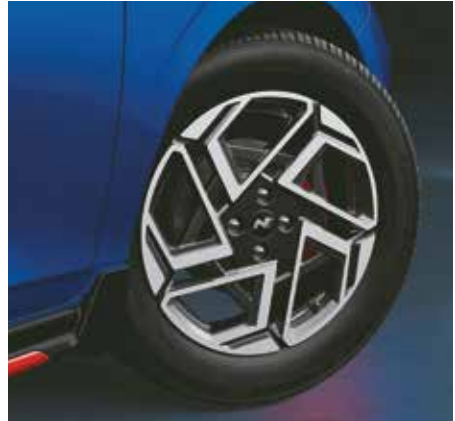
R16 (D=405.6 mm) Diamond cut alloy wheels