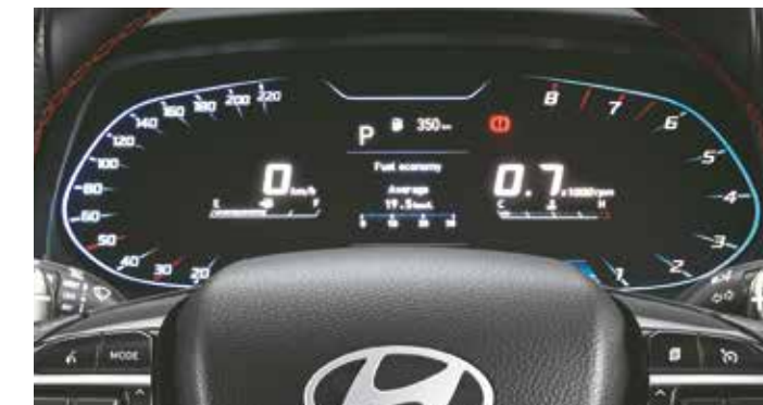
Digital cluster with TFT multi information display

Other features: Perforated leather wrapped gear knob with N logo | Sliding front armrest | Sporty metal pedals Dark metal finish inside door handles | Fast USB charger (Type C)