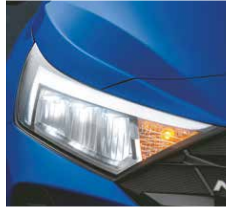
LED headlamps with signature LED DRLs