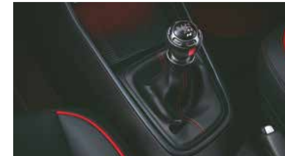
6-speed MT (Manual transmission)