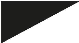
Atlas white with abyss black roof