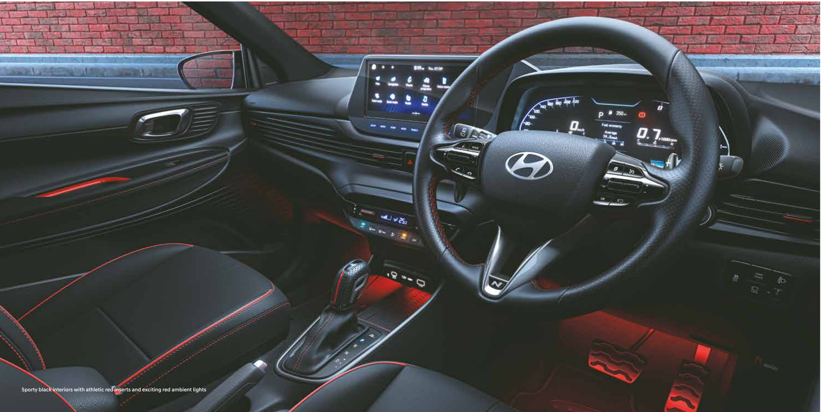
Sporty black interiors with athletic red inserts and exciting red ambient lights