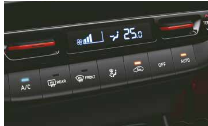
FATC with digital display

Other features: Smart entry with push button start/stop