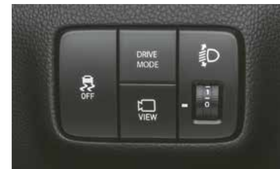
Drive mode select