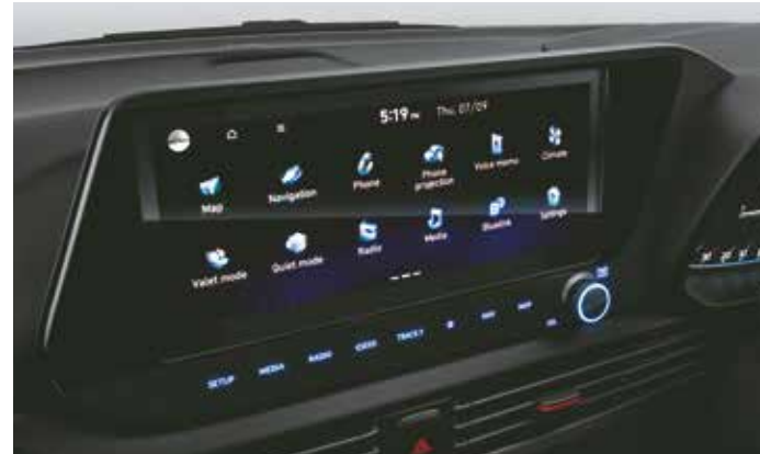
26.03 cm (10.25 ) HD touchscreen infotainment & navigation system

Connectivity comes easy in the new Hyundai i20 N Line. Equipped with cutting edge technology like home-to-car (H2C) with Alexa, fully automated temperature control, advanced infotainment with multilingual user interface, you've got the world at your fingertips.