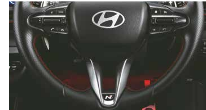
3-spoke steering wheel with N logo